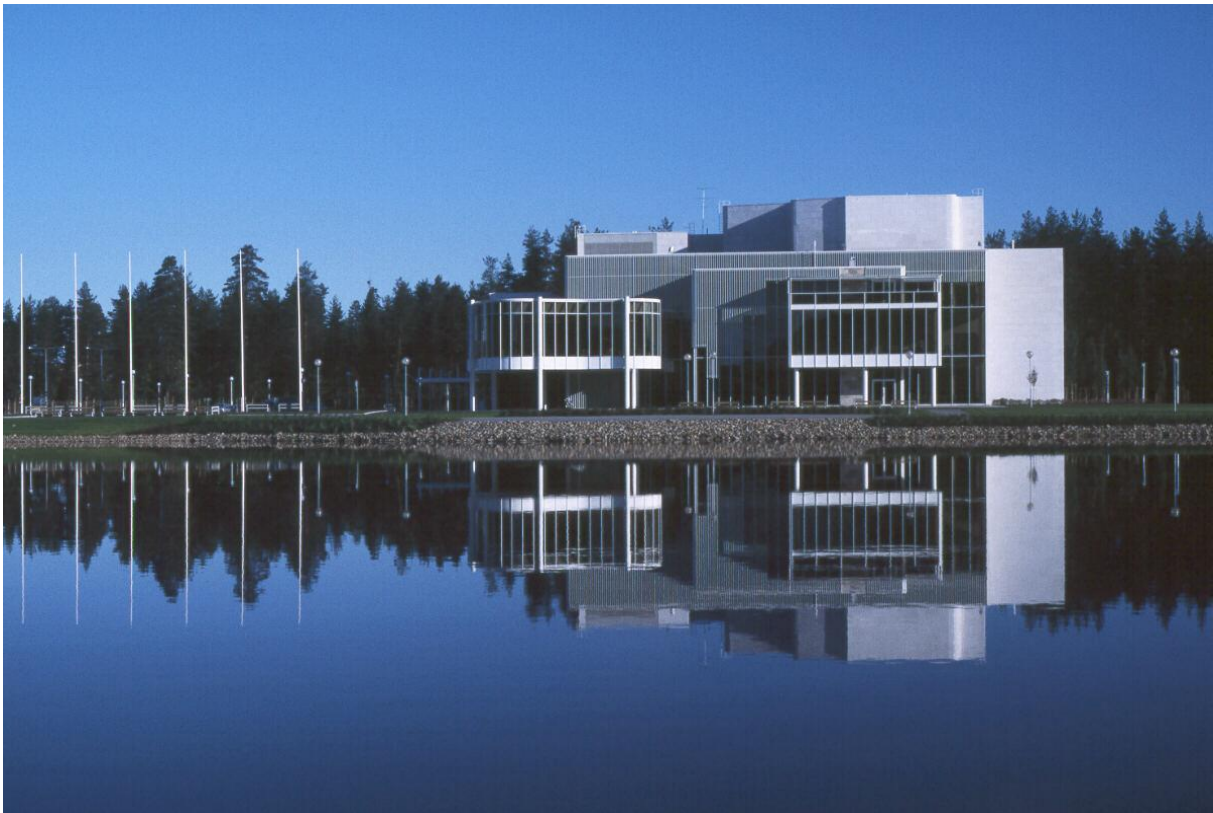
Concert Hall Mikaeli, Mikkeli 1984-86 – as the Project Manager and Leading Architect at Architect Office Arto Sipinen