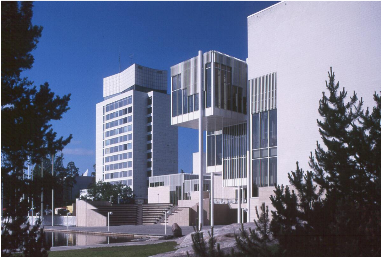
Cultural Centre of Tapiola, Espoo 1981-89 – as the Project Manager and Leading Architect at Architect Office Arto Sipinen