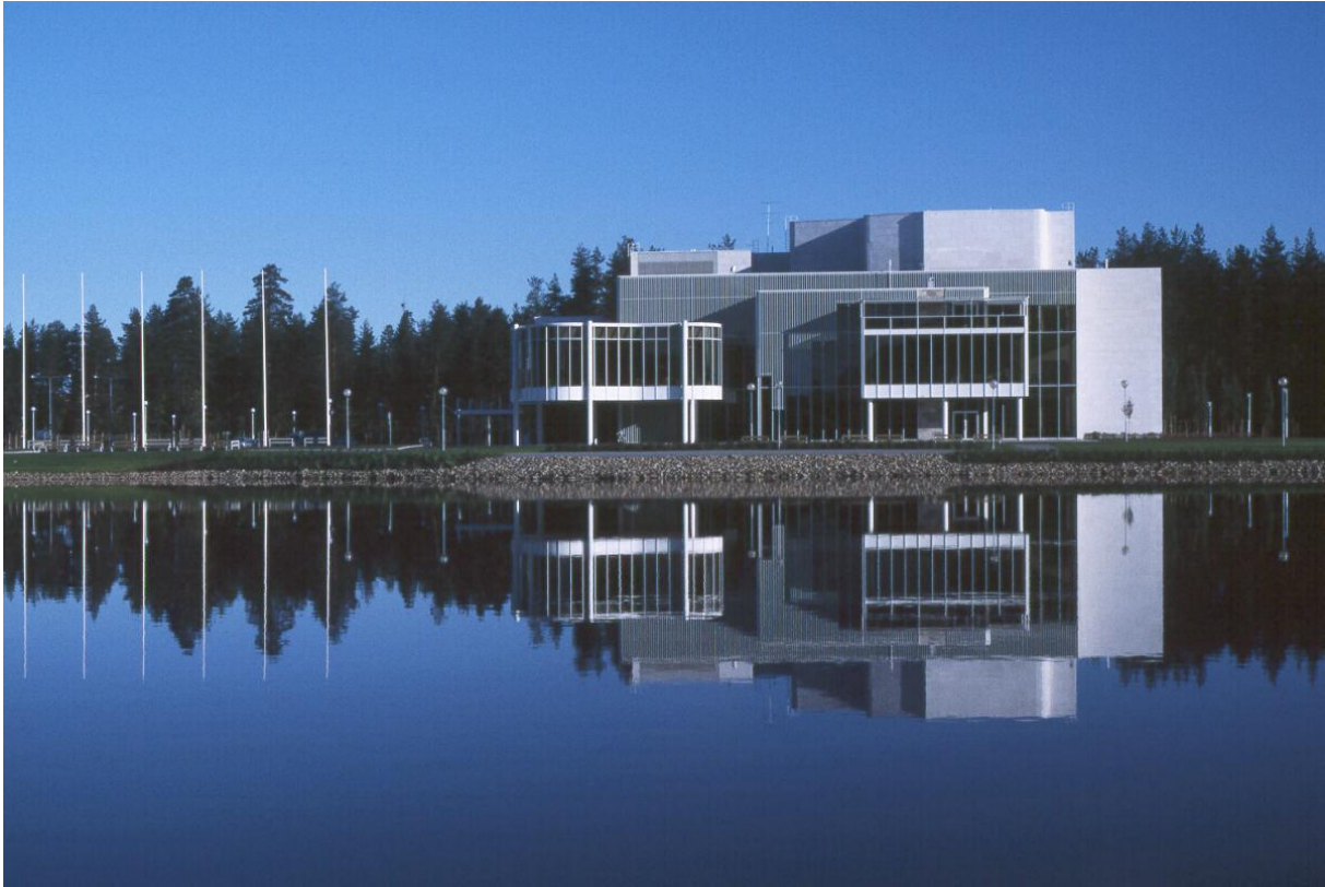
Concert Hall Mikaeli, Mikkeli 1984-86 – as the Project Manager and Leading Architect at Architect Office Arto Sipinen